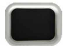
Plastic Drip Trays